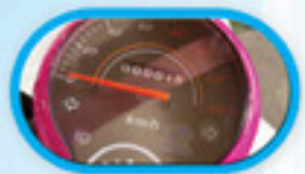
Classic Meter Panel