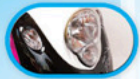
Retro Head lights