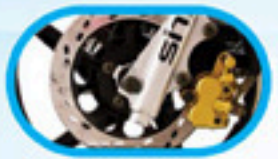
Front Disc Brake